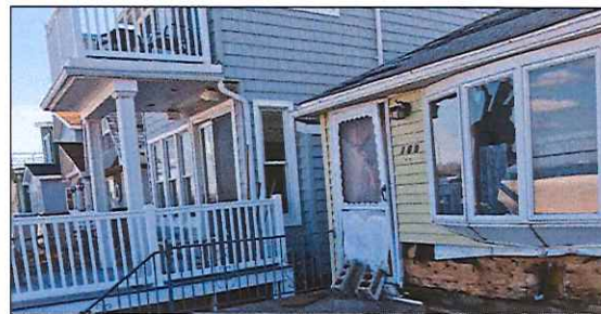
Thousands of dollars in flood damage can be prevented by building higher.

Through a national consensus process, building higher has been part of the International Building and Residential Codes and the American Society of Civil Engineers' flood design and construction standard (ASCE 24).