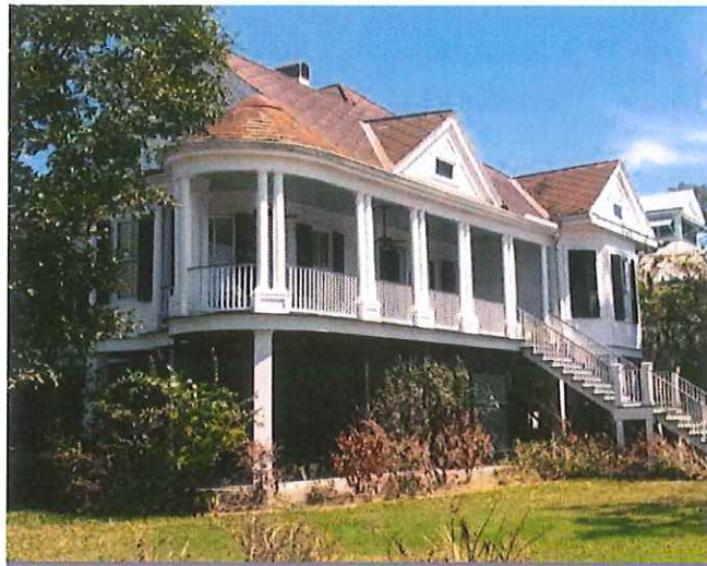
Figure 1: House elevated above the BFE with 1 foot of freeboard

Communities that incorporate freeboard into their local floodplain ordinances can earn discounts on flood insurance by participating in the NFIP’s Community Rating System (CRS) program. CRS rewards communities that engage in floodplain management activities that exceed NFIP standards by offering discounts of up to 45 percent on flood insurance policies written for SFHAs in NFIP-participating communities.