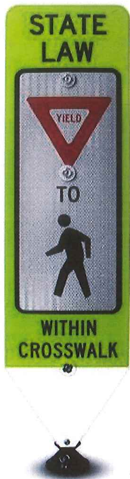
Front & Back View