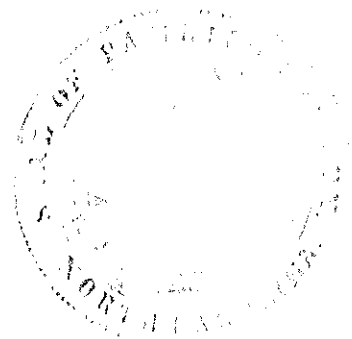
Clerk to the Board